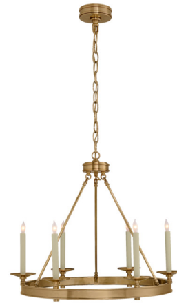
Shown in antique burnished brass

The Launceton Ring Chandelier offers the timeless appeal of a traditional wagon wheel design, complete with candlestick lamp holders and bobèches. Available in both classic and contemporary finishes, the Launceton complements many interior design styles, from farmhouse or rustic to urban and modern.