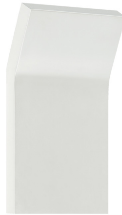
Shown in matte white

The Bend Wall Sconce brings a clean minimalism to your interior space. The simple, rectangular body has an off-center bend and complemented with a polycarbonate diffuser that cast a warm glow of light against your wall. Note: Smallest size is ADA compliant.