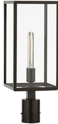
Shown in aged iron / clear

The Fresno Outdoor Post Light brings a clean simplicity to your exterior space. The smooth, clean frame is complemented by clear glass that casts warm light across your area. Standard post is required, and sold separately.