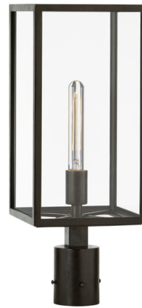
Shown in aged iron / clear

The Fresno Outdoor Post Light brings a clean simplicity to your exterior space. The smooth, clean frame is complemented by clear glass that casts warm light across your area. Standard post is required, and sold separately.