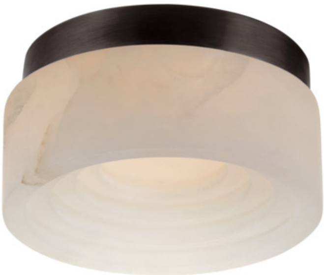
Shown in: Bronze / Alabaster

The Otto Ceiling Light spotlights the beauty of natural alabaster stone with its pure, concentrically carved form. An integrated LED light shines through the stone, highlighting its veining and variations in color. The Otto adds an organic yet modern touch to your space and is especially well suited for bathrooms. TRIAC dimmable.