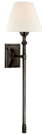
Shown in gun metal / linen

The Jane Tail Wall Sconce brings a clean decorative look to your interior space. The frame looks to be pieces of metal welded together, and is topped with a crisp, tapered shade that casts warm light across your room. Note: Fixture does not cover a standard US junction box and requires a 2 x 4 inch junction box.