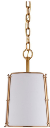
Shown in hand-rubbed antique brass / white

The Hastings Pendant brings a bold, tailored look to your interior space. The smooth frame is complemented with a shade joined by decorative pins and accented with tubular framework. Shade can be installed inverted, if you desire.