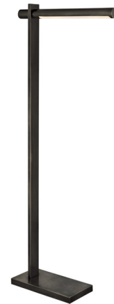
Shown in bronze