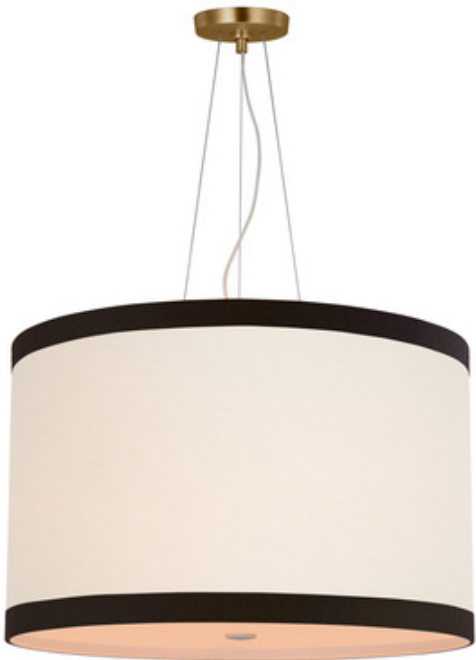
Shown in: Gild / Cream Linen / Black Linen

Celebrating the timeless drum shade, the Walker Pendant showcases this classic, simple silhouette. The linen shade seems to float in the air, suspended on discreet cables, and is tastefully embellished with wide trim inspired by preppy tailoring. The linen shade and an acrylic bottom diffuser soften the light and disperse it throughout your space.