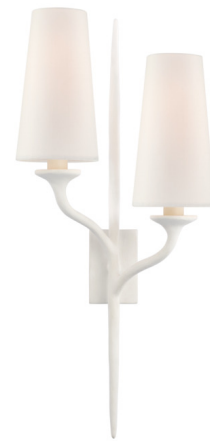
Shown in plaster white / linen

The Iberia Double Wall Sconce brings an elegant beauty to your interior space. The gently curving organic form is inspired by tree branches, and is topped by conical linen shades that casts warm light across your room. Note: Fixture does not cover a standard US junction box and requires a 2 x 4 inch junction box.