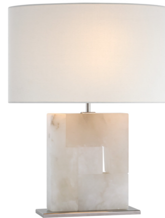
Shown in polished nickel / alabaster

The Ashlar Table Lamp is inspired by the puzzle-like precision, hand-cut stone walls of Machu Picchu. The rectangular body, with cuts of natural alabaster, rests on a finished base. An oval shaped linen shade that casts warm light across your room, completes the look. Dimmer switch is located on the lamp socket. Note: Alabaster is a natural stone and variations in color and texture make each piece unique.