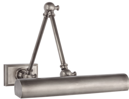
Shown in antique nickel

The Cabinet Maker Double Plug-in / Hardwired Library Light adds a classic look to your space. The double arm can adjust to direct light where you need it. If used as a plug-in, On/Off switch is located on the cord, 18 inches from the backplate. Note: If hardwiring this piece, Fixture does not cover a standard US junction box and requires a 2 x 4 junction box.