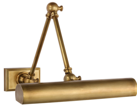
Shown in hand-rubbed antique brass

The Cabinet Maker Double Plug-in / Hardwired Library Light adds a classic look to your space. The double arm can adjust to direct light where you need it. If used as a plug-in, On/Off switch is located on the cord, 18 inches from the backplate. Note: If hardwiring this piece, Fixture does not cover a standard US junction box and requires a 2 x 4 junction box.