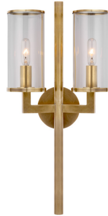
Shown in antique-burnished brass

The Liaison Double Wall Sconce is a modern update of the classic candlestick sconce design, defined by its clean silhouette and simplified lamp holders with bobeches. Choose smooth clear glass or no glass for a sleek look, or the fractured crackle glass for a more vintage or rustic feel. Note: Fixture does not cover a standard US junction box and requires a 2 x 4 inch junction box.