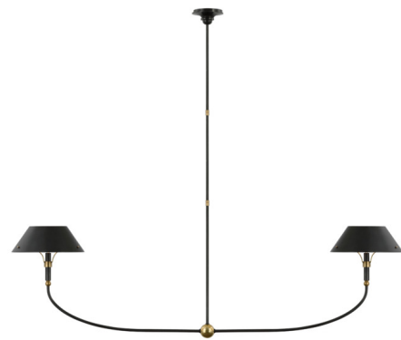
Shown in bronze / hand-rubbed antique brass

The sleek Turlington Linear Chandelier is composed of two lights set on a minimal elongated frame and topped with flared metal shades. Its contemporary allure makes it the perfect choice for enhancing the ambiance of a modern dining room or kitchen. Note: Custom overall heights are available. For quotes, please contact our sales team.