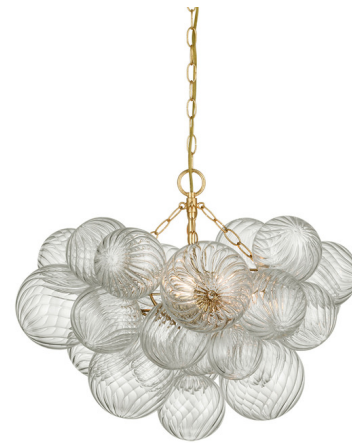
Shown in gild / clear

PRODUCT DIMENSIONS . . . . . Adjustable Chain Length: 72"