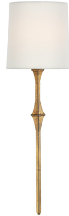
Shown in gild / linen

The Dauphine Wall Sconce brings a traditional look to your interior space. The classic torch like body is topped with a linen shield that casts warm light across your room. Note: Fixture does not cover a standard US junction box and requires a 2 x 4 inch junction box.