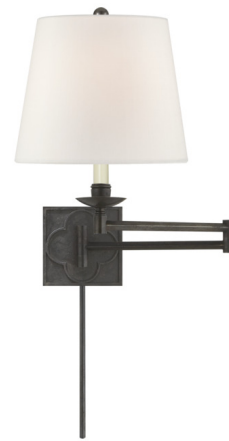
Shown in aged iron / linen

The Griffith Swing Arm Plug-in Wall Sconce brings a clean midcentury modern look to your interior space. The decorative backplate, with swing arm, is topped by a tapered shade that casts a warm glow of light across your room. Dimmer switch is located on the socket. Matching cord cover is included. Note: May be hardwired, see installation instructions.