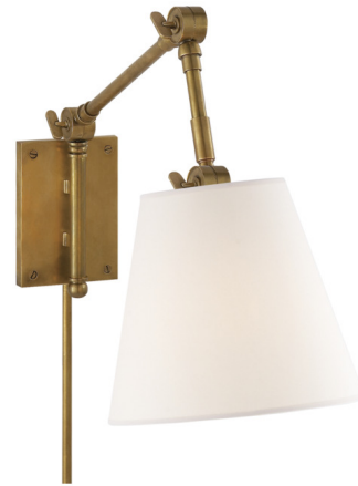
Shown in hand-rubbed antique brass / linen

The Graves Pivoting Plug-in Wall Sconce brings both a refined form and function to your interior space. The frame adjusts at 2 spots with the turn knob and is topped with a tapered linen shade that casts a warm glow of light exactly where you need in. Includes matching cord cover. On/Off pull chain operation. Note: May be hardwired, see installation instructions.