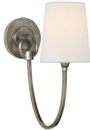
Shown in antique nickel / linen

With its simple curved arm and tapered shade, the Reed Wall Sconce offers a refined, versatile aesthetic that effortlessly complements various interior settings. The shade, made of linen or paper, diffuses the light to create a soft glow that fills your space. Place this light on either side of a fireplace, or in a dining room to add a layer of warm ambient lighting. Note: Some finish/shade combinations are not available.