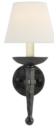
Shown in blackened rust / linen

The Iron Torch Wall Sconce brings a clean traditional look to your interior space. The classic torch shaped frame holds a tapered shade that casts a warm glow of light across your room. Note: Small size has a tapered cone shaped shade. Note: Large size has a tapered rectangular shaped shade.