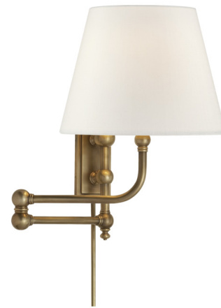
Shown in antique-burnished brass / linen

The Pimlico Swing Arm Wall Light offers vintage appeal with its classic metal finishes and knob accents along its jointed arm. The design is topped with a linen or paper shade that glows warmly as it disperses a soft light into your space. The arm extends to place the light right where it is needed, perfect for bedside lighting or in a reading nook. This fixture can be hardwired or installed as a plug-in. Cord covers are included for plug-in use. Note: With hardwired mounting, the fixture does not cover a standard US junction box and requires a 2 x 4 inch junction box.