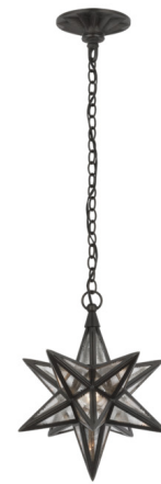
Shown in aged iron / antique mirror

The Moravian Star Pendant combines worn metal finishes with antiqued mirror glass panels to create a charming vintage aesthetic. Styled as a single pendant or clustered in multiples to form a starry installation, this geometric lighting lends a jewelry-like accent to your interior space. The 12.25 inch wide pendant is rated for damp locations, and the other sizes are rated for dry. Note: The 48 inch wide pendant requires additional ceiling support due to its weight.