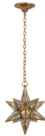
Shown in gilded iron / antique mirror

The Moravian Star Pendant combines worn metal finishes with antiqued mirror glass panels to create a charming vintage aesthetic. Styled as a single pendant or clustered in multiples to form a starry installation, this geometric lighting lends a jewelry-like accent to your interior space. The 12.25 inch wide pendant is rated for damp locations, and the other sizes are rated for dry. Note: The 48 inch wide pendant requires additional ceiling support due to its weight.