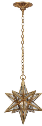
Shown in gilded iron / antique mirror

The Moravian Star Pendant combines worn metal finishes with antiqued mirror glass panels to create a charming vintage aesthetic. Styled as a single pendant or clustered in multiples to form a starry installation, this geometric lighting lends a jewelry-like accent to your interior space. The 12.25 inch wide pendant is rated for damp locations, and the other sizes are rated for dry. Note: The 48 inch wide pendant requires additional ceiling support due to its weight.