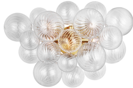
Shown in gild / clear

The Talia Wall Sconce will enhance your interior environment with its enchanting design. A collection of swirled artisanal glass orbs in different sizes is elegantly positioned on a metal framework, creating a warm interplay of shadows throughout your space. NOTE: This is a discontinued floor model and limited to quantity on hand.