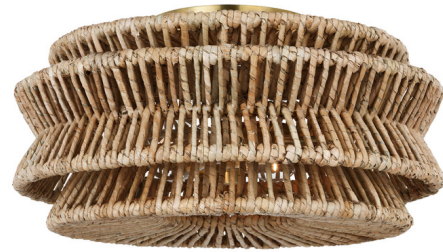
Shown in antique-burnished brass / natural abaca

The Antigua Ceiling Flush Light brings the timeless beauty of nature to your interior space. Hand woven natural abaca is wrapped around a wide trapezoid shaped frame, allowing light to peek out and cast warm shadows across your room.