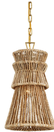
Shown in antique-burnished brass / natural abaca

The Antigua Pendant introduces the enduring elegance of nature into your living area. Crafted from hand-woven natural abaca, it envelops a trapezoidal frame, permitting light to filter through and create inviting shadows throughout your space. Note: Bronze option is not available in the 23 inch height.