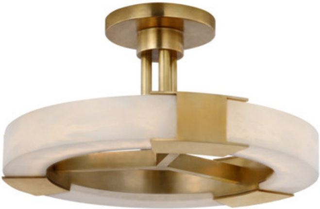
Shown in: Antique-Burnished Brass / Alabaster

The Covet Ring Semi Flush Ceiling Light brings a clean organic look to your interior space. The smooth frame is complemented with natural Alabaster, that casts a warm glow of light across your room. Alabaster has subtle variations in color, making each piece unique.