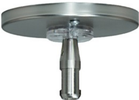
Shown in: Satin Nickel

A single feed canopy is mounted to the ceiling above the Monorail run. It brings power to the Monorail run from a single feed remote transformer (sold separately). The low-voltage leads from the remote transformer are connected to the canopy leads inside the electrical box the canopy mounts to the electrical box. 4 inch round canopy mounts to a standard 4 inch electrical box with round plaster ring (not included). Finish available in Satin Nickel or Antique Bronze. ETL listed. 4 inch x 2.5 inch height x 4 inch length.