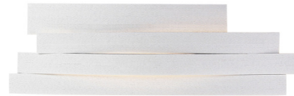
Shown in stainless steel / white

LAMP COLOR . . . . . 2700K LUMENS/WATT . . . . . 135.93 LUMINOUS FLUX . . . . . 1604 lumens