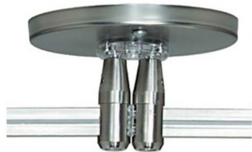
Shown in: Satin Nickel

A dual feed canopy is mounted to the ceiling above the center of the Monorail run. It brings power to the Monorail run from a dual feed remote transformer (sold separately). The low-voltage leads from the remote transformer are connected to the canopy leads inside the electrical box and the canopy mounts to the electrical box. Isolating connectors are included to isolate power feeds from each other. 4 inch round canopy mounts to a standard 4 inch electrical box with round plaster ring (provided by electrician). Finish available in Satin Nickel or Antique Bronze. ETL listed. 4 inch width x 2.5 inch height x 4 inch length.