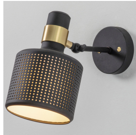
Shown in black / brushed brass

The Riddle Wall Sconce pairs a perforated, machined brass shade with an interior fabric diffuser for a sleek, industrial aesthetic that provides warm, soft light. The lampshade is cylindrical at the bottom before steeply tapering to a narrow stem. The sconce is supported by a round backplate and sleek stem with a hinged joint which allows the sconce to be tilted up and down to aim the light. Note: Includes mounting plate to cover standard 4 inch US junction box. Available in Textured Black or Brushed Brass finish with a Brushed Brass accent ring.