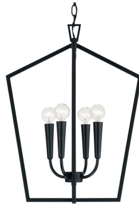
Shown in matte black

With a classic elegance that commands attention, the Holden Pendant adds sleek sophistication to any space. The tapered candle sleeves adds designer style to the familiar lantern silhouette.