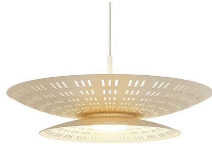
Shown in cream / opal