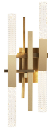
Shown in satin brass / crystal