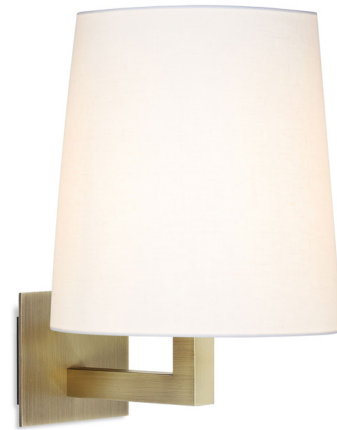
Shown in satin bronze / white cotton

The Tonda Wall Light features a stylish transitional design that will complement a wide variety of decor styles. The tapered fabric shade provides diffused illumination with a neat and clean-lined aesthetic. It is accented by an angled arm and rectangular backplate to complete the look. Available with or without an adjustable LED spotlight to provide additional downlighting.