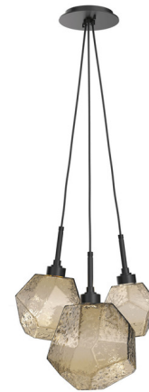
Shown in matte black / bronze

COLOR RENDERING . . . . . 93 CRI LAMP COLOR . . . . . 3000K LUMENS/WATT . . . . . 197.12 LUMINOUS FLUX . . . . . 1025 lumens