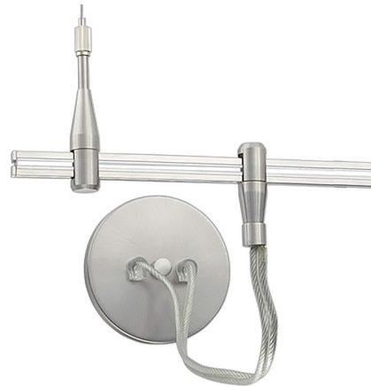
Shown in satin nickel