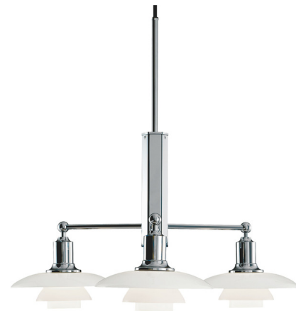
Shown in chrome / white opal

PRODUCT DIMENSIONS . . . . . Adjustable Cable Length: 144"