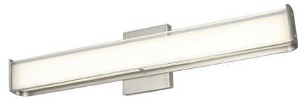
Shown in brushed nickel / frosted

COLOR RENDERING . . . . . 90 CRI LAMP COLOR . . . . . 3000K LUMENS/WATT . . . . . 59.52 LUMINOUS FLUX . . . . . 1488 lumens