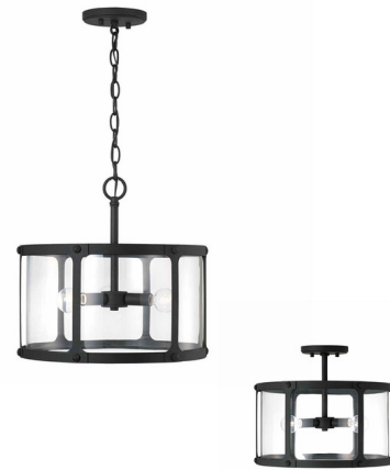
Shown in black / clear

PRODUCT DIMENSIONS . . . . . Min / Max overall height: 12.75" / 140"