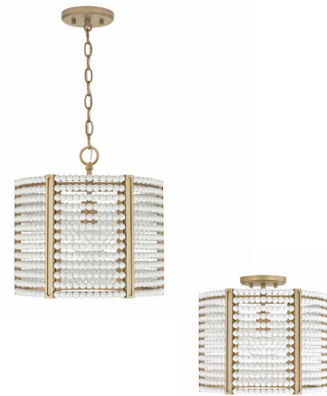
Shown in aged brass

PRODUCT DIMENSIONS . . . . . Min / Max overall height: 12.75" / 140.25"