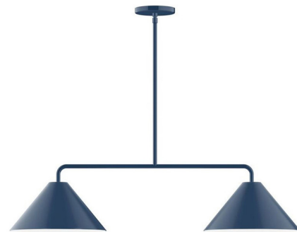
Shown in navy

The Axis Pinnacle Linear Pendant brings a classic geometric look to your interior space. The clean, smooth cone shaped shades, lined in White, cast warm shadows around your room. Polyester powder coat finish provides color retention and scratch resistance. Hang straight swivel at canopy included.