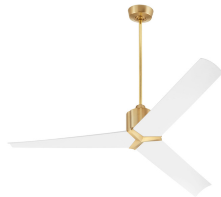
Shown in aged brass / white / white