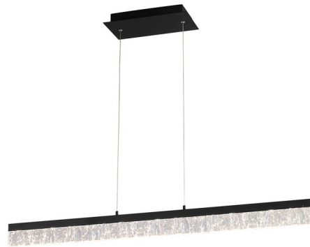
Shown in black / clear