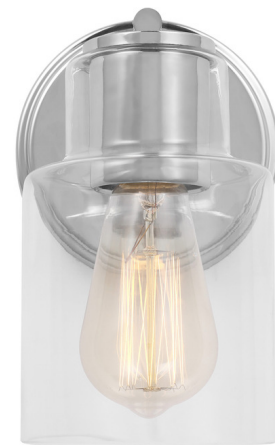
Shown in chrome / clear

COLOR . . . . . Clear BODY FINISH . . . . . Chrome WATTAGE . . . . . 75W DIMMER . . . . . Standard 120V DIMENSIONS . . . . . 5"W x 7.875"H x 6.375"D BULB NOT INCLUDED 1 x Edison ST-Shape/Medium (E26)/75W/120V Incandescent OTHER BULB OPTIONS . . . . . 1 x A19/Medium (E26)/120V Incandescent 1 x A19/Medium (E26)/120V LED 1 x Edison ST-Shape/Medium (E26)/120V LED COUNTRY OF ORIGIN . . . . . China