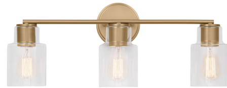
Shown in satin brass / clear

COLOR . . . . . Clear BODY FINISH . . . . . Satin Brass WATTAGE . . . . . 225W DIMMER . . . . . Standard 120V DIMENSIONS . . . . . 24"W x 9.625"H x 6.375"D BULB NOT INCLUDED 3 x Edison ST-Shape/Medium (E26)/75W/120V Incandescent OTHER BULB OPTIONS . . . . . 3 x A19/Medium (E26)/120V Incandescent 3 x A19/Medium (E26)/120V LED 3 x Edison ST-Shape/Medium (E26)/120V LED COUNTRY OF ORIGIN . . . . . China