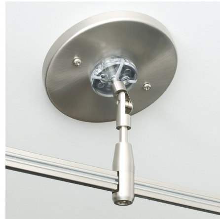
Shown in satin nickel

For use in installing Monorail to a vaulted ceiling. Installs to the power feed (sold separately) and adjusts to any angle to position rail parallel to the floor. Finish in Satin Nickel or Antique Bronze. ETL listed. 0.6 inch width x 1.6 inch height.