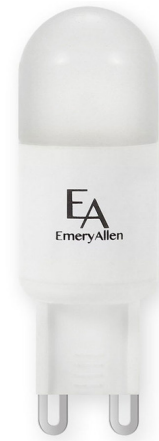
Shown in frost