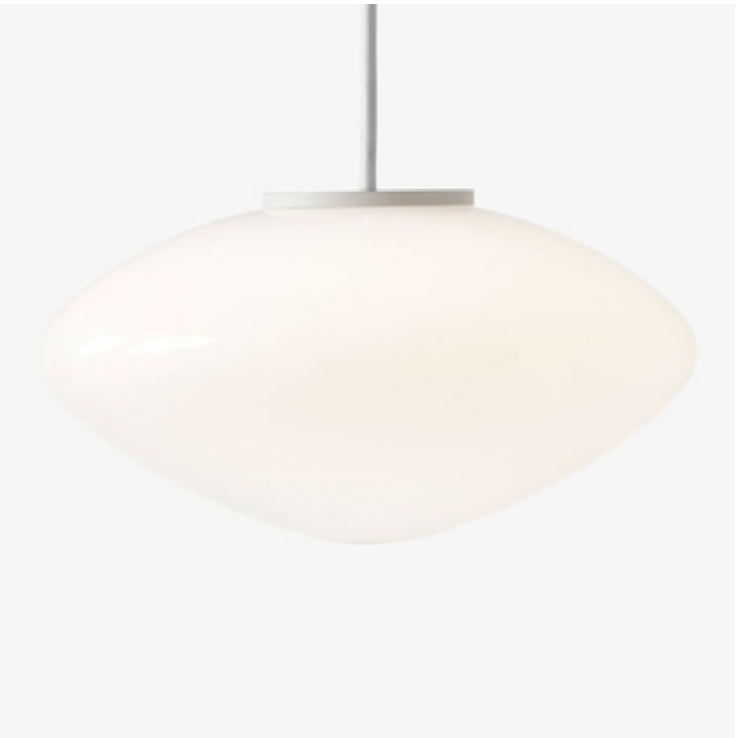
Shown in: Matte White / Opal

The Mist Pendant was inspired by classic glass globe pendants, with a modified shape giving it a contemporary twist. The mouthblown opal glass shade softly diffuses light to evoke the glow of the sun as it peeks through a morning haze.