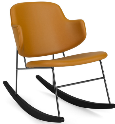
Shown in black / dakar cognac leather

Originally designed by Danish architect Ib Kofod-Larsen in 1953, the Penguin Rocking Chair remains popular today as an icon of Scandinavian mid-century design. Penguin is lightweight and elegant, with a gently curved upholstered back and seat crafted from plywood. The steel frame contrasts the chair's organic curves with straight lines, while the solid wood rocker legs echo the organic nature of the design.